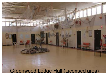
Greenwood Lodge Hall (Licensed area)

Why not consider Arkaroola for your next corporate convention, conference or wedding?